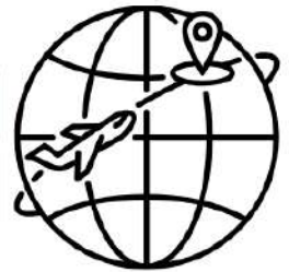
Source: Philippine Statistics Authority (PSA)