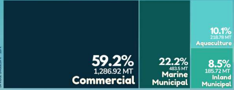
Value of Production by Subsector