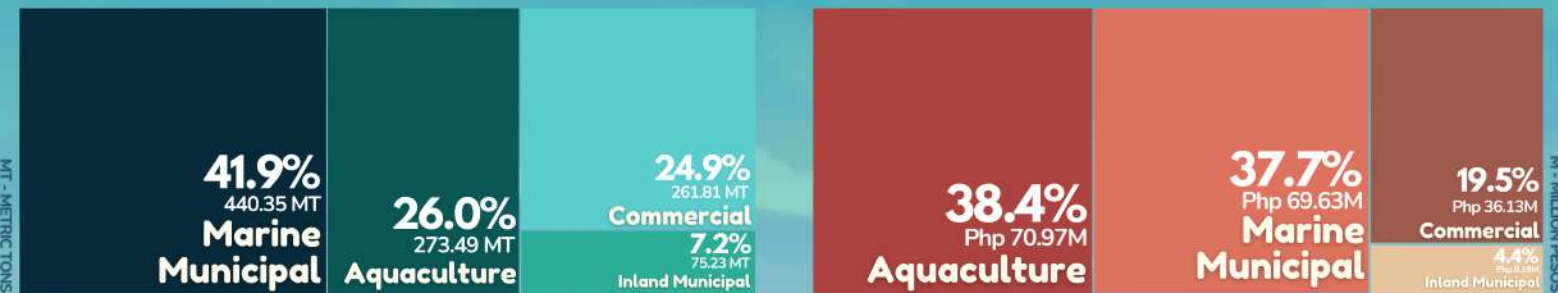
Value of Production by Subsector