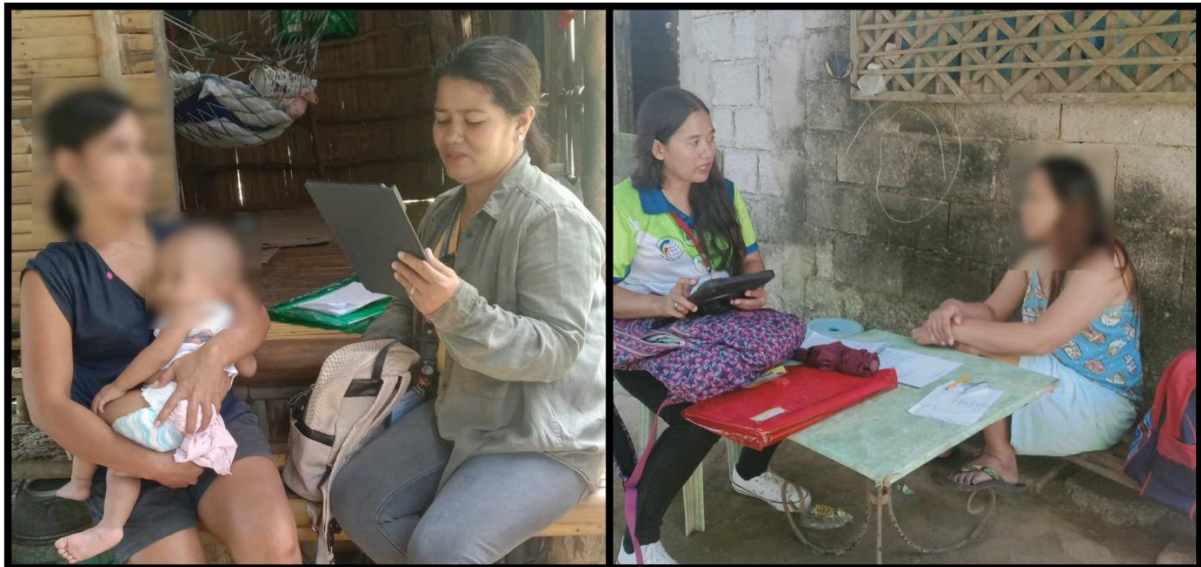
PSA-Marinduque SRs conducting interviews of respondents from sample households of April 2024 LFS

The Philippine Statistics Authority (PSA) Provincial Statistical Office (PSO) of Marinduque is currently conducting the April 2024 Labor Force Survey (LFS), from April 8 to 30, 2024. The authority and mandate of the PSA to conduct the said project emanate from Republic Act (RA) No. 10625 or the Philippine Statistical Act of 2013, which authorizes the PSA to prepare and conduct periodic censuses on various sectors of the economy.