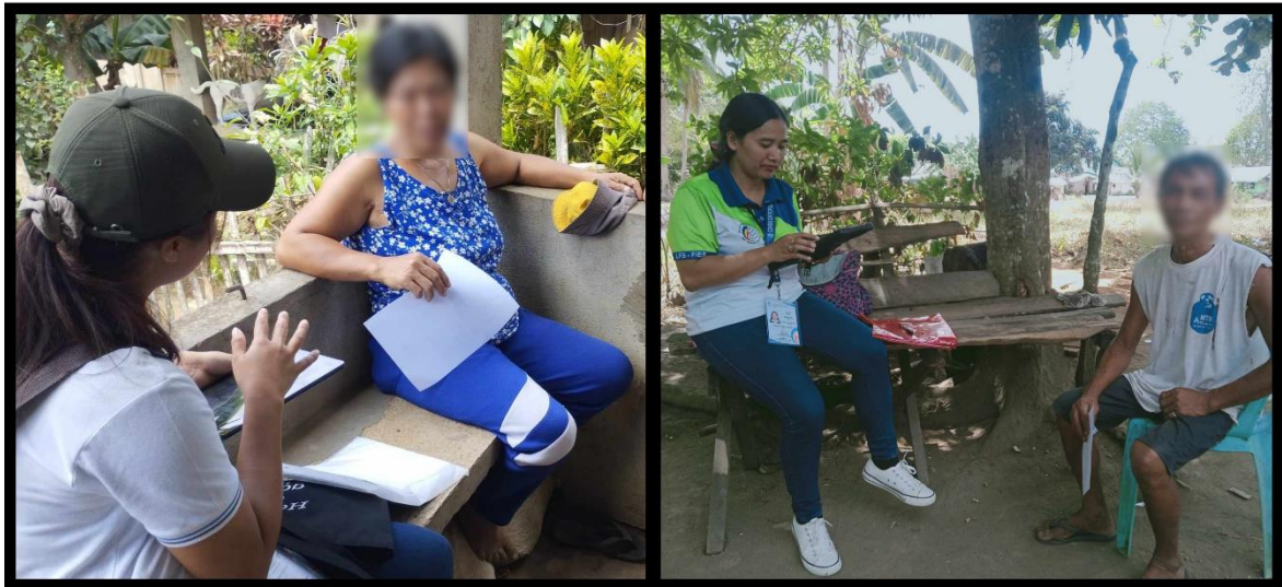
PSA-Marinduque SRs conducting interviews of respondents from sample households of March 2024 LFS

The Philippine Statistics Authority (PSA) Provincial Statistical Office (PSO) of Marinduque is currently conducting the March 2024 Labor Force Survey (LFS), from March 8 to 28, 2024. The authority and mandate of the PSA to conduct the March 2024 LFS emanates from Republic Act (RA) No. 10625 or the Philippine Statistical Act of 2013, which authorizes the PSA to prepare and conduct periodic censuses on various sectors of the economy.