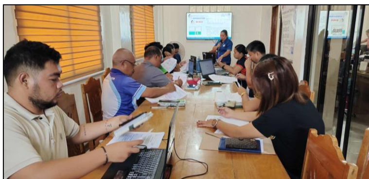
SS II Sualog presents the overview of PSIC to the participants in the LGU of Buenavista

Recognizing the necessity for standardized statistics at both national and local levels, the Philippine Statistics Authority (PSA) issued Resolution No. 18 in 2021. This Resolution emphasizes the adoption of the Philippine Standard Industrial Classification (PSIC) and the Philippine Standard Geographic Code (PSGC) in various government processes,