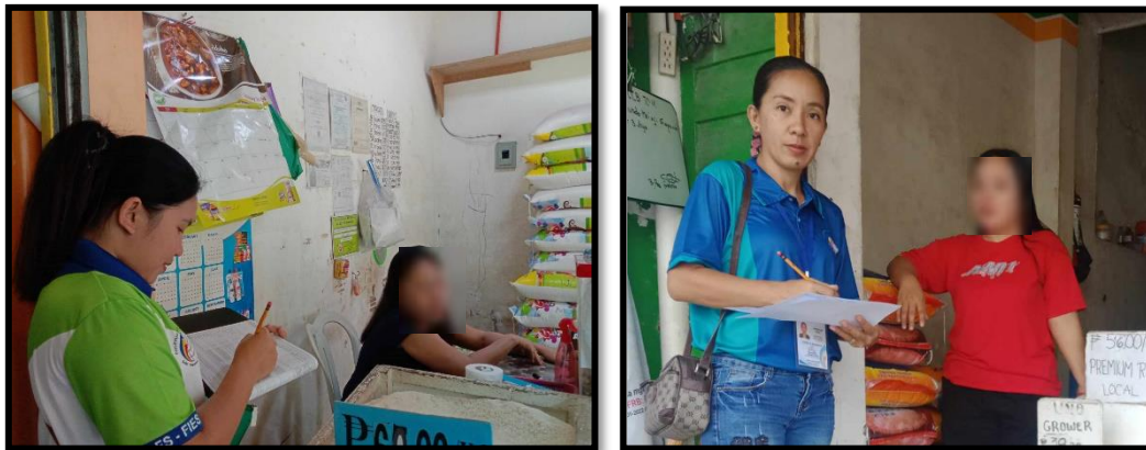
PSA-Marinduque SRs conducting interviews with sample establishments of Re-designed April 2024 RCSS: C

The Philippine Statistics Authority (PSA) Marinduque Provincial Statistical Office (PSO) successfully conducted the April 2024 Re-designed Rice and Corn Stocks Survey: Commercial (RCSS: C) , from 01 to 04 April 2024. The PSA's authority and mandate to conduct this survey emanates from Republic Act (RA) 10625, or the Philippine Statistical Act of 2013, which authorizes the PSA to prepare and conduct surveys and periodic censuses on various sectors of the economy.