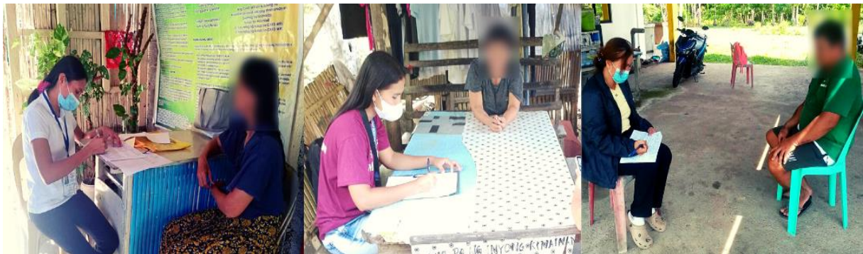
PSA-Marinduque SRs conducting interviews of respondents from sample households of First Quarter 2024 Redesigned Crops Production Survey

The Philippine Statistics Authority (PSA) Provincial Statistical Office (PSO) of Marinduque conducted the First Quarter 2024 Redesigned Crops Production Survey (CrPS) , for ten days covering the period March 14 to 24, 2024, including Saturdays and Sunday. The authority and mandate of the PSA to conduct the First Quarter 2024 CrPS emanates from Republic Act (RA) No. 10625 or the Philippine Statistical Act of 2013, which authorizes the PSA to prepare and conduct periodic censuses on various sectors of the economy.