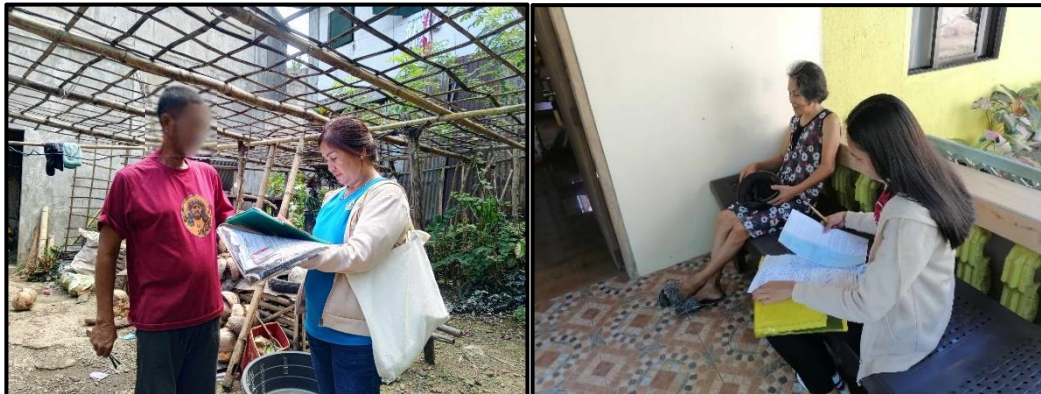
PSA-Marinduque SRs conducting interviews with sample palay- and corn-farming households of March 2024 MPCSRs.

The Philippine Statistics Authority (PSA) Marinduque Provincial Statistical Office (PSO) successfully conducted the March 2024 Monthly Palay and Corn Situation Reporting System (MPCSRs) , from, 01 to 06 March 2024. The PSA's authority and mandate to conduct this survey emanates from Republic Act (RA) 10625, or the Philippine Statistical Act of 2013, which authorizes the PSA to prepare and conduct surveys and periodic censuses on various sectors of the economy.