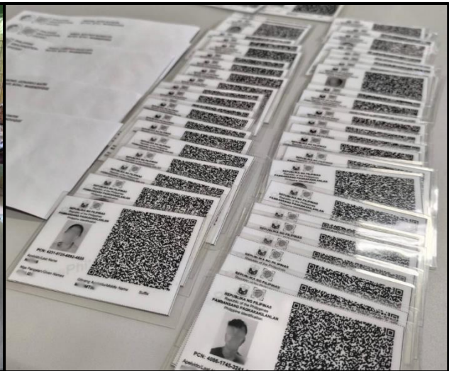
Laminated ePhilIDs of registrants of Barangay Bayuti, Boac, Marinduque.

The Philippine Statistics Authority (PSA) Marinduque Provincial Statistical Office (PSO) successfully distributed 105 laminated ePhilIDs to the residents of Barangay Bayuti, Boac, Marinduque on 06 May 2024. This initiative aims to extend the benefits of the Philippine Identification System, enhancing comprehensive identification accessibility, particularly for individuals in remote areas.