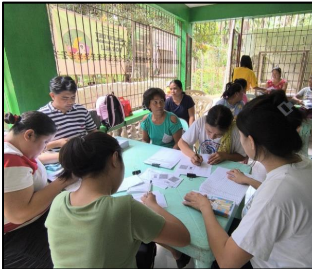
PhilSys Registration Team releasing the ePhilIDs of registrants from Barangay Bayuti, Boac, Marinduque.