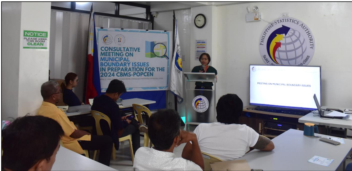
CSS Opis discusses the background of map processing

PSA-Marinduque PSO recently initiated preparations for the 2024 Census of Population - Community-Based Monitoring System (POPCEN-CBMS) by organizing a consultative meeting to address municipal boundary issues in Marinduque on 14 April 2024, at the Marinduque Provincial Statistical Office.