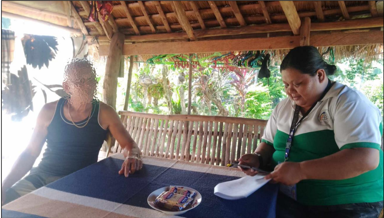
PSA-Marinduque SR conducting interviews of respondents from sample households of January 2024 CES

Date of Release: 25 January 2024 Reference No.: 2024PR-01-005