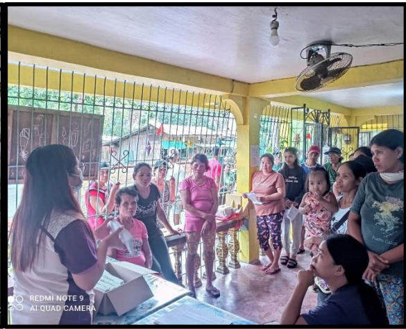
PhilSys Registration Team conducts ePhilID distribution and information dissemination campaign in Barangay Tugos, Boac, Marinduque.

The Philippine Statistics Authority (PSA) Marinduque Provincial Statistics Office (PSO) is making great strides in extending PhilSys Step 2 Registration throughout the province. By collaborating with Local Government Units (LGU) and private institutions and implementing various saturation drives, such as "PhilSys on Wheels" and mobile registrations, a total of 190,135 registrants from the six (6) municipalities in the province have successfully been included in the Philippine Identification System. This achievement marks an 88 percent accomplishment of the provincial target as of December 31, 2023.