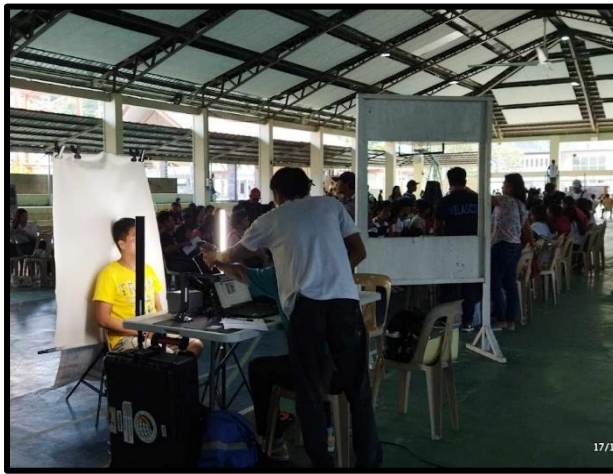
PhilSys Registration Team conducts Step 2 Registration of DSWD Beneficiaries at Marinduque Convention Center in Barangay Bangbalon, Boac, Marinduque.