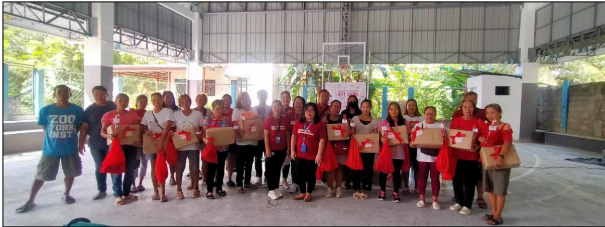
PSA-Marinduque personnel, together with the solo parents and SB of Barangay Amoingon, Boac, Marinduque, posed with smiles, proudly displaying the gifts provided by PSA-Marinduque PSO

The Philippine Statistics Authority (PSA) Marinduque Provincial Statistical Office (PSO) celebrated Valentine's Day with an act of kindness through a gift-giving activity. The aim of this event was to honor and recognize the love and sacrifices of exemplary solo parents, with Barangay Amoingon, Boac, Marinduque, as the chosen beneficiary community.