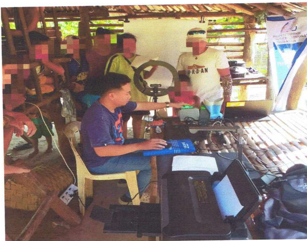
PhilSys Mobile Registration at Sitio Bagong Silang, Brgy. Cambunang, Bulalacao

Date of Release: 12 January 2024 Reference No.: 2024-PR-004