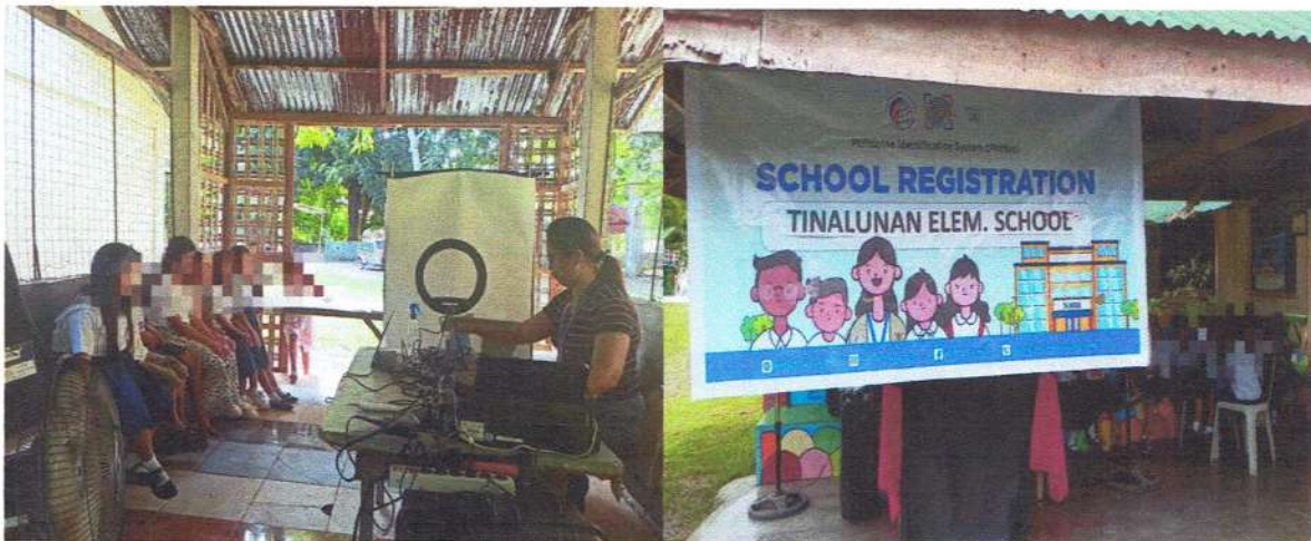
PhilSys School Registration in the Municipality of Gloria: Tinalunan Elementary School (right) and Malamig Elementary School (left)

Date of Release: 12 January 2024 Reference No.: 2024-PR-005