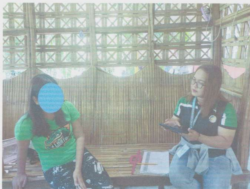
PSA Statistical Researcher conducting an interview of the respondent of the sample household.

Date of Release: 26 February 2024 Reference No.: 2024-PR-010