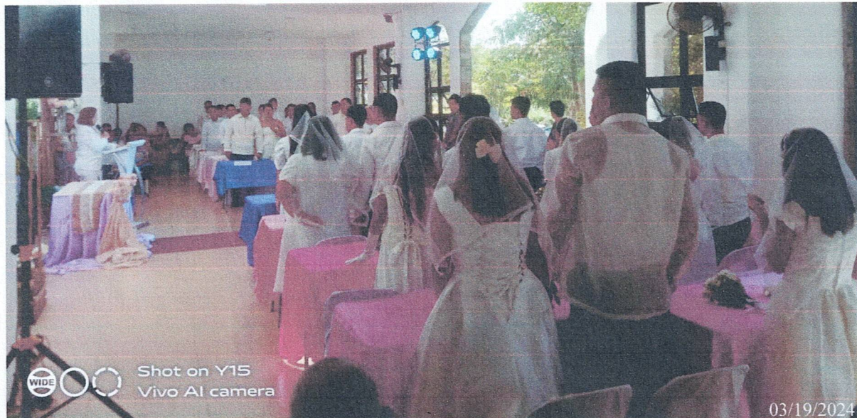
Nineteen couples tied the knot in the Kasalang Bayan of Calapan City