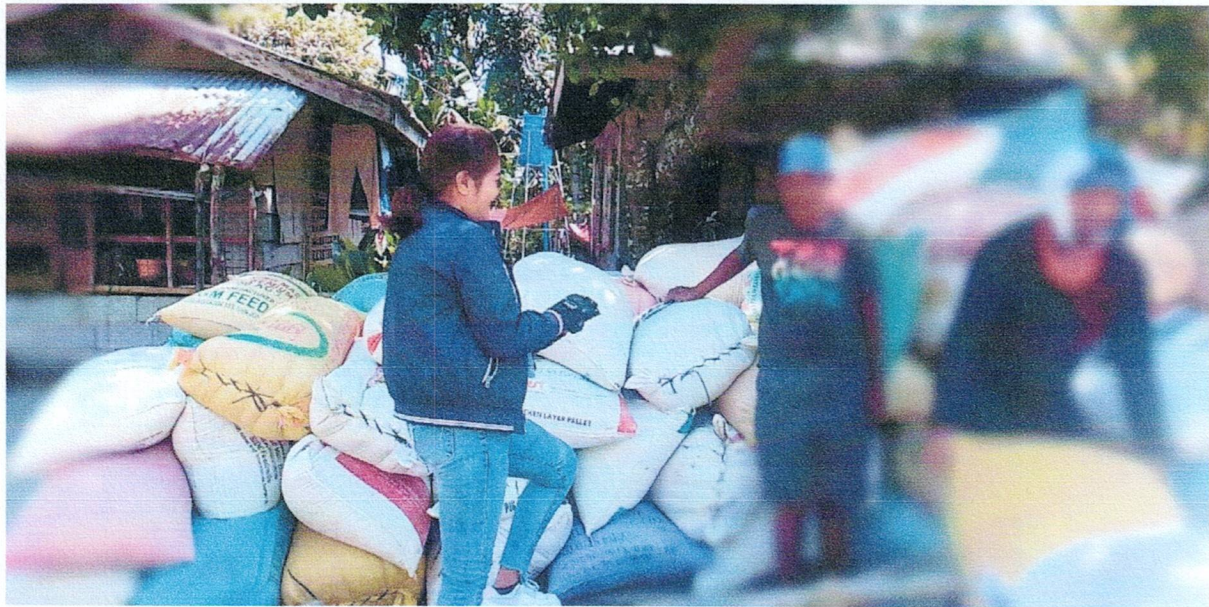
PSA FPS SR while conducting the actual interview with one of the qualified palay farmer.

Date of Release: 02 May 2024 Reference No.: 2024: - PR - 017