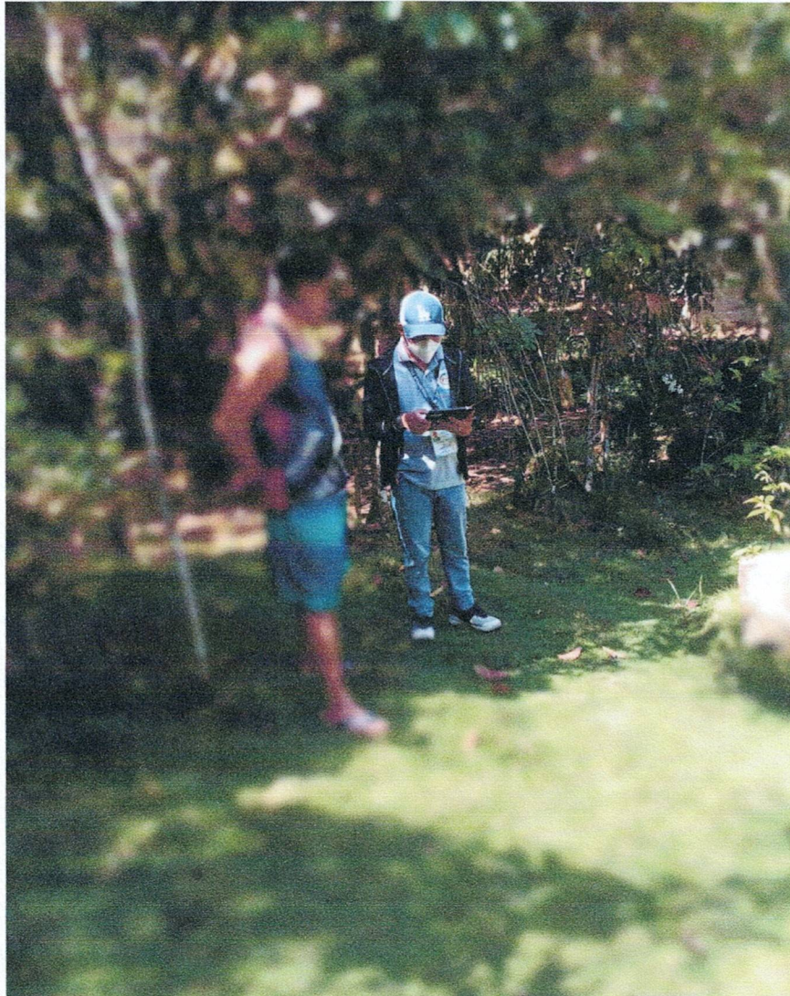
PSA SR while conducting the CrPS interview with one of the sample farmers/producers.

Date of Release: 02 May 2024 Reference No.: 2024 – PR - 018