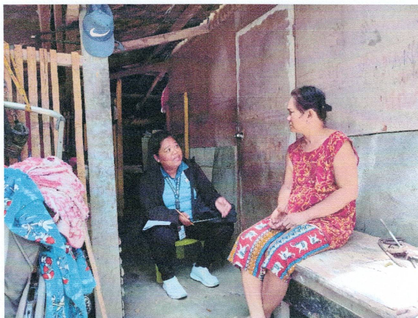
PSA Statistical Researcher while conducting an interview with a respondent in one sample household of LFS.

Date of Release: 02 May 2024 Reference No.: 2024-PR-019