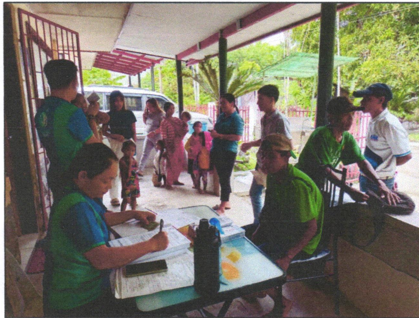
Screening Process to registrants at Barangay Bigaan, San Teodoro

Additionally, a mobile registration was conducted in the remote Municipality of San Teodoro community of Barangay Bigaan. The goal of the registration, which took place on 05 April 2024, was to register indigenous individuals who had not yet been registered with PhilSys. Nine of the 61 residents that were registered also obtained their ePhilIDs.