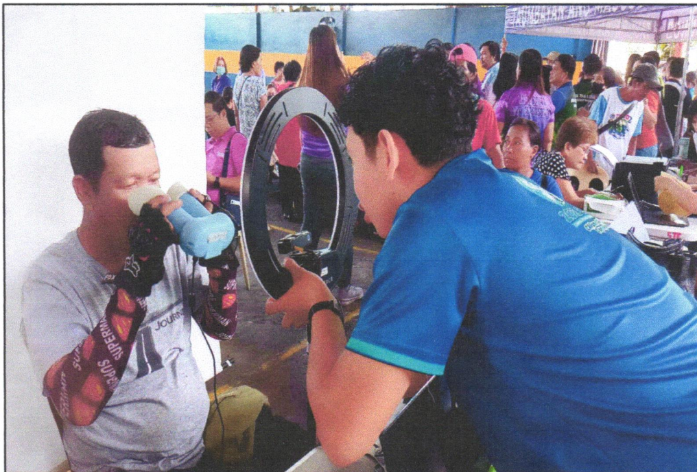
PhilSys Mobile Registration at Barangay Ilaya Covered Court, Calapan City

As of 11 May 2024, the Philippine Statistics Authority (PSA) of Oriental Mindoro had successfully registered 740,278 Mindoreños through the Philippine Identification System (PhilSys) Step 2 Registration. As per the 2020 Census of Population and Housing (CPH), it accounts for 81.50 percent of Oriental Mindoro's total population of 908,339 people.