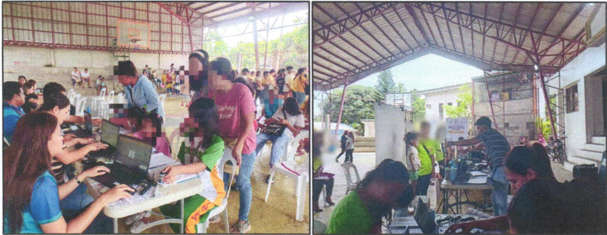
PhilSys Personnel captures biometric authentication of a 4Ps beneficiary (left), PhilSys Registration of a child during Family Development Session (FDS) in Brgy. Sapul, Calapan City

As of 10 May 2024, the Philippine Statistics Authority (PSA) Oriental Mindoro and the Department of Social Welfare and Development (DSWD) Provincial Operations Office of Oriental Mindoro had successfully verified the identities of 12,728 4Ps beneficiaries through the National ID's online biometric authentication application.