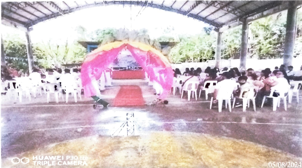
Eleven couples tied the knot in the Kasalang Barangay of Malo, Bansud

Date of Release: 14 May 2024 Reference No.: 2024-PR-023