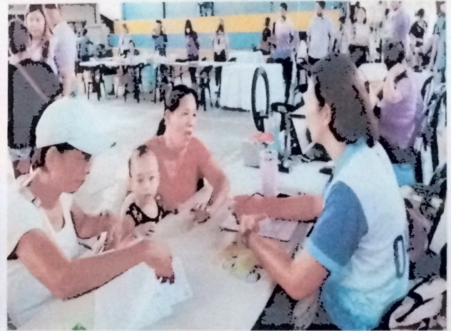
Mobile registration at Barangay Ilaya, Calapan City

The Provincial Statistical Office (PSO) of Philippine Statistics Authority – Oriental Mindoro joins the City Government of Calapan's Serbisyong TAMA Program para sa Barangay on April 15, 2024 at barangay Gutad and on April 29, 2024 at barangay Ilaya. Different agencies from Local and National Government participated to the program to bring their services to the participants.