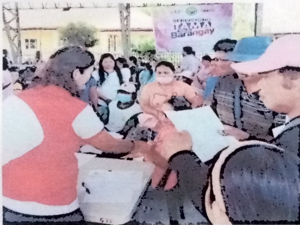
Distribution of IEC Materials at Barangay Gutad