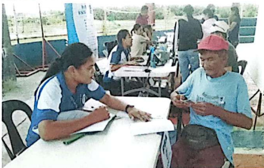
Mobile Registration at Barangay Tawagan, Calapan City

Date of Release: 16 May 2024 Reference No.: 2024-PR-025