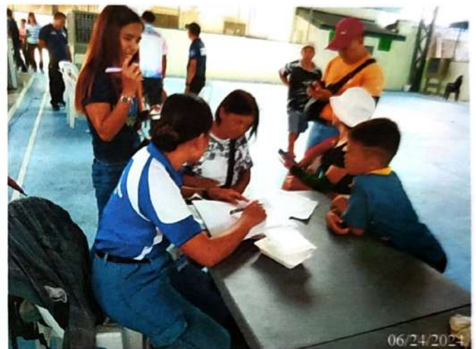
Mobile Registration at Baranaav Putina-tubia and Baranaav Lumanabavan. Calapan City

June 2024 – CALAPAN CITY, ORIENTAL MINDORO. The Provincial Statistical Office (PSO) of Philippine Statistics Authority – Oriental Mindoro joined the City Government of Calapan's Serbisyon TAMA Program para sa Barangay on June 10 and 24, 2024 at barangay Putingtubig and barangay Lumangbayan. Different agencies from the Local and National Government participated to the program to bring their services to the participants.