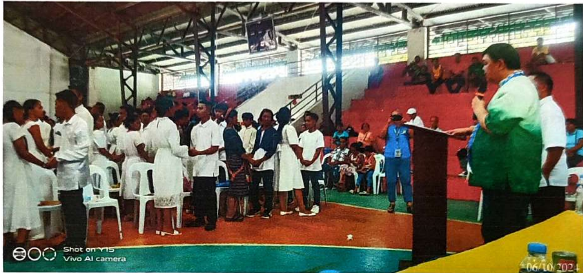
About 114 couples tied the knot in the Kasalang Bayan of Mansalay