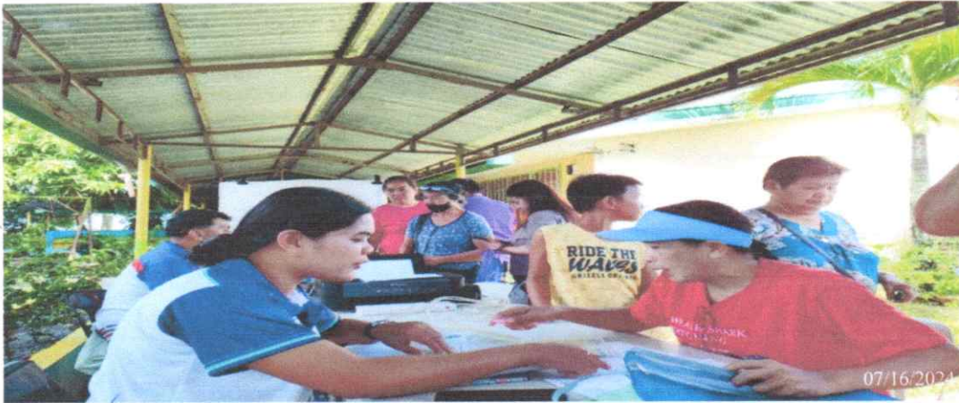
Mobile Registration at Biga Elementary School, barangay Biga, Calapan City

Date of Release: 25 July 2024 Reference No.: 2024-PR- 032