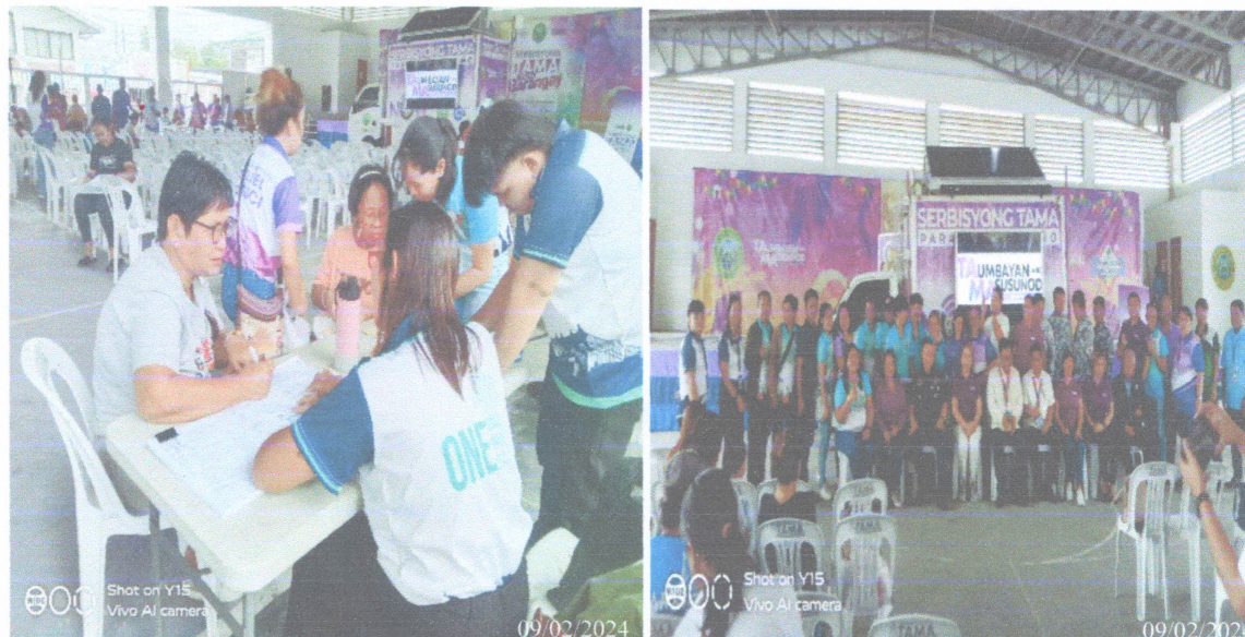
Picture taken during the Serbisyong TaMa held at Calapan City Plaza Pavillion last September 02, 2024

02 September 2024 – CALAPAN CITY, ORIENTAL MINDORO. Philippine Statistics Authority - Provincial Statistical Office (PSO) of Oriental Mindoro joined the City Government of Calapan's Serbisyong TaMa Program para sa Barangay on 02 September 2024 at Calapan City Plaza Pavillion. Different agencies from the Local and National Government participated to the program to bring their services to the participants from barangay Ibaba East and Ibaba West.