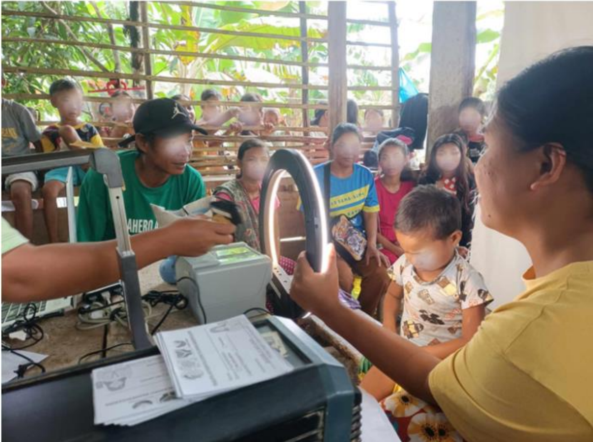
National ID Mobile Registration of Palaw'an Indigenous People in Sitio Onggong, Bgy. Latud in municipality of Rizal, Palawan

The PhilSys Registration team went the extra mile to conduct National ID Mobile Registration in various Indigenous Communities in some municipalities of the province. PSA Palawan is committed in the implementation of the PhilSys registration to ensure that the National ID System has reached every individual, targeting those still unregistered especially the population in the marginalized sector.