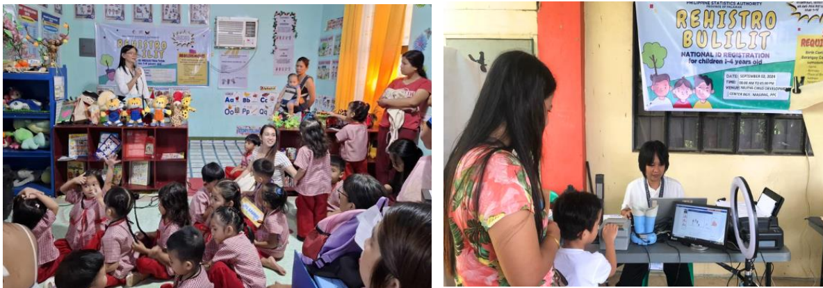
Simultaneous launching of Rehistro Bulilit National ID Registration for 1-4 years old in Brilliant Child Development Center (right) and Mutya Child Development Center (left)

02 September 2024 – PUERTO PRINCESA CITY. The Palawan Provincial Statistical Office of Philippine Statistics Authority Palawan launches the “ Rehistro Bulilit Campaign”: a National ID Registration for one to four years old at Brilliant Child Development Center in barangay Maunlad and at Mutya Child Development Center in barangay Masipag, both in Puerto Princesa City. The campaign targeted the mentioned age group to be registered in the Philippine Identification System (PhilSys).