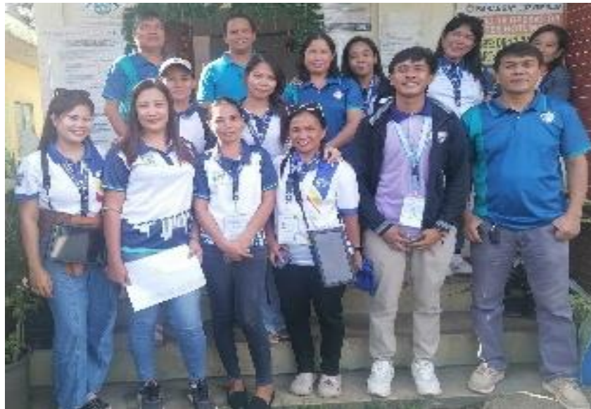
The hired SRs with their Supervisors during the training in preparation for the conduct of the January 2025 LFS.

Date of Release: 21 January 2025 Reference No. 2025-PR-001