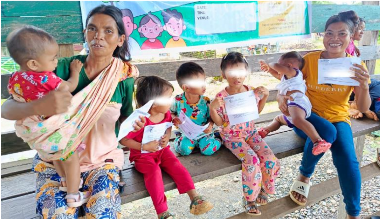
Rehistro Bulilit National ID Registration in Barangay Culandanum, Aborlan, Palawan

Date of Release: 27 January 2025 Reference No. 2025-PR-005