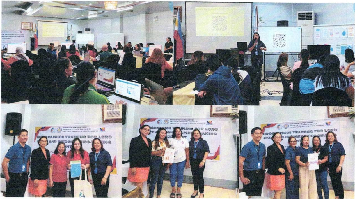
Discussion and awarding of winners of Infographics Making Contest

Date of Release: 11 February 2025 Reference No. 2025-PR-010