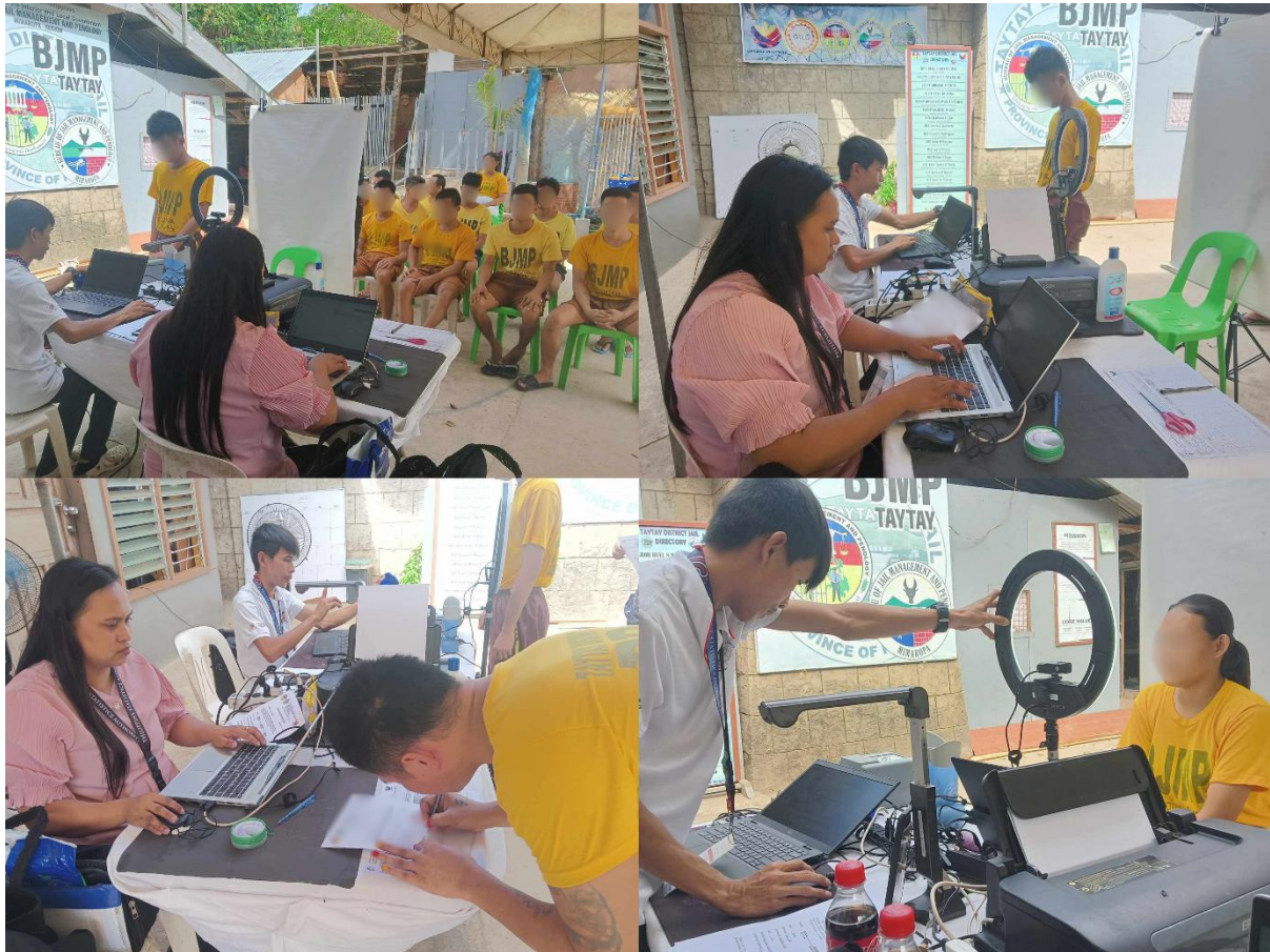
RKO Venturillo and RA Larot facilitating the National ID registration.

Date of Release: 31 March 2025 Reference No. 2025-PR-014