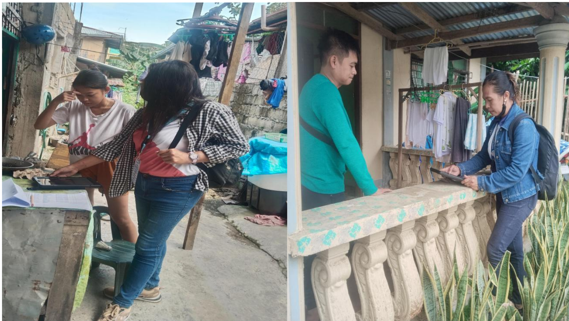
Hired Statistical Researchers during the data collection for the Consumer Expectations Survey.

Date of Release: 05 June 2025 Reference No. 2025-PR-020