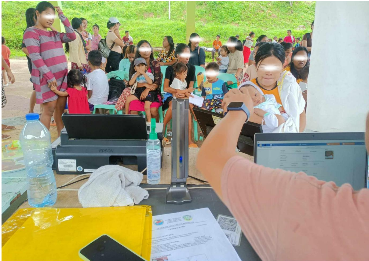
National ID Mobile Services in Proper Barangay Binudac, Culion, Palawan

All registration activities are free of charge, and residents are advised to bring supporting documents such as a birth certificate or any valid identification card. With continued cooperation among PSA, local government units, and barangay officials, the PhilSys rollout is expected to register thousands of individuals in the coming weeks.