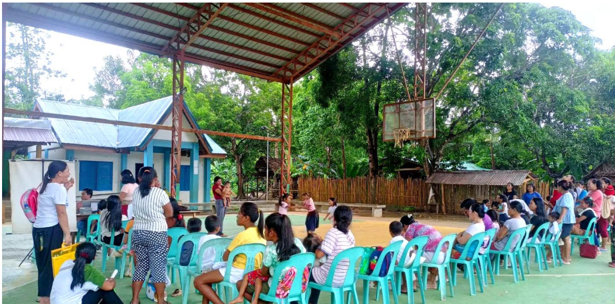
National ID Mobile Services in Sitio Caminango, Barangay Galoc, Culion, Palawan

Date of Release: 19 June 2025 Reference No. 2025-PR-021