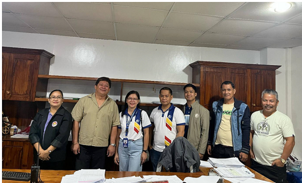
PSA Palawan Team with selected LGU Linapacan Personnel led by Hon. Emil T. Neri – Municipal Mayor of the Municipality of Linapacan (Leftmost-Male)

17 July 2025 – LINAPACAN, PALAWAN. The Provincial Statistical Office (PSO) of Palawan presented the preliminary results of the 2024 Community-Based Monitoring System (CBMS) for the Municipality of Linapacan on 17 July 2025 at the Local Government Unit (LGU) of Linapacan Municipal Building, Bgy. San Miguel, Linapacan, Palawan. This activity was done to validate the data collected from the said municipality and to provide insights and understanding on the initial findings of the CBMS.