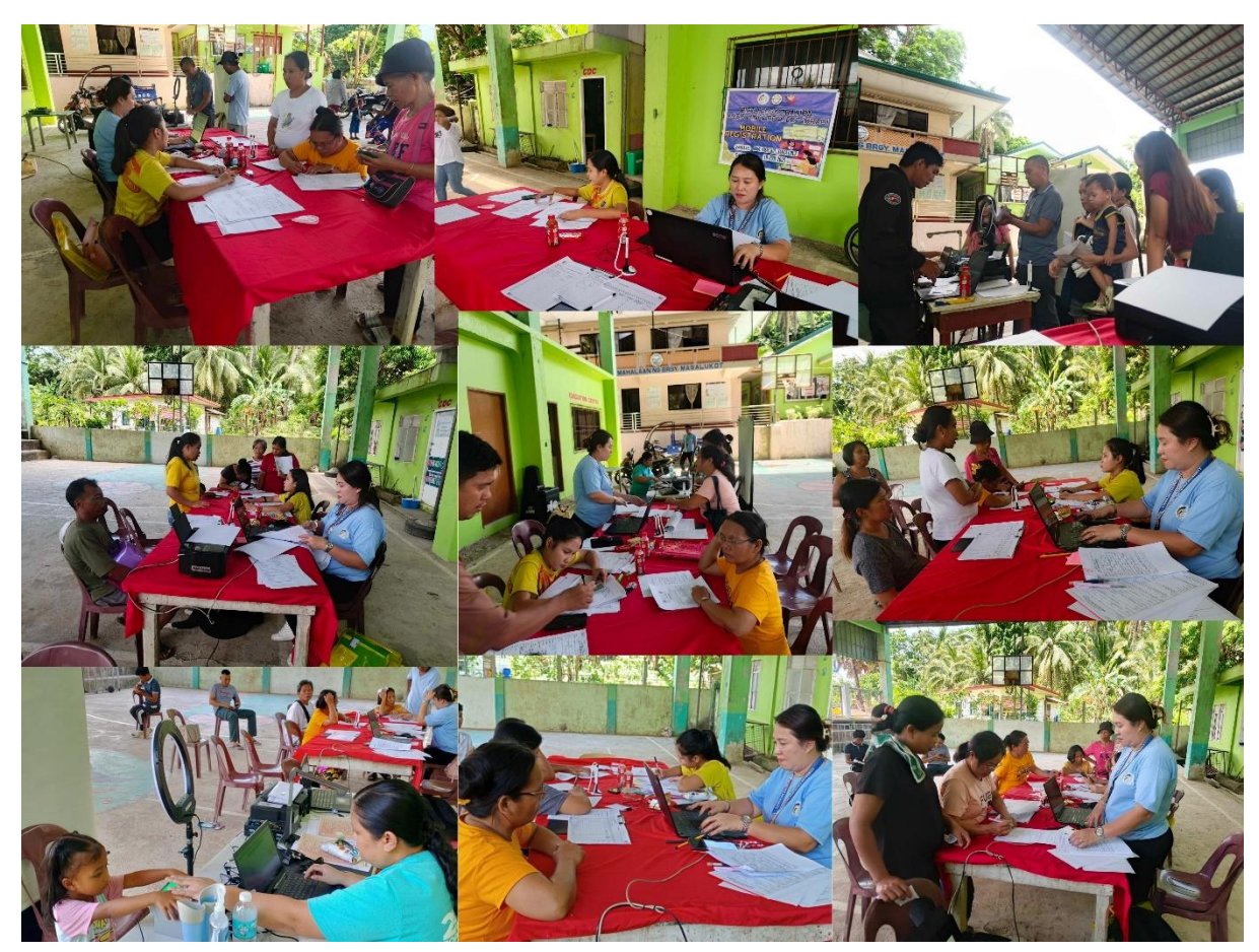
On 10 April 2025, personnel from PSA PSO Marinduque, in coordination with LCRO Santa Cruz, conducted a BRAP Mobile Registration and National ID Registration activity for the residents of Barangay Masalukot, Santa Cruz.

Date of Release: 11 April 2025 Reference No.: 2025PR-04-054