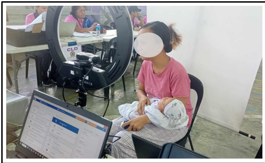
Registration Kit Operator while capturing the biometrics of the one-month-old baby, during the Serbisyong TAMA Fair at Brgy. Camilmil, Calapan City, Oriental Mindoro.

Date of Release: 03 December 2024 Reference No. 2024-38