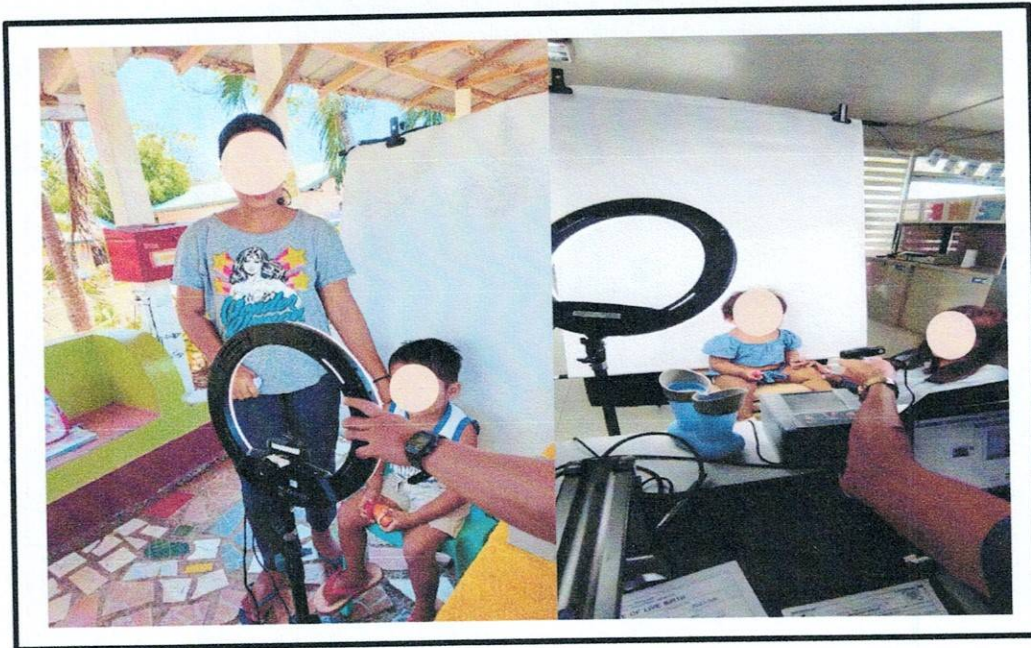
Parents and children during the PhilSys Registration of one to four years old

Date of Release: 26 March 2024 Reference No. 2024-11