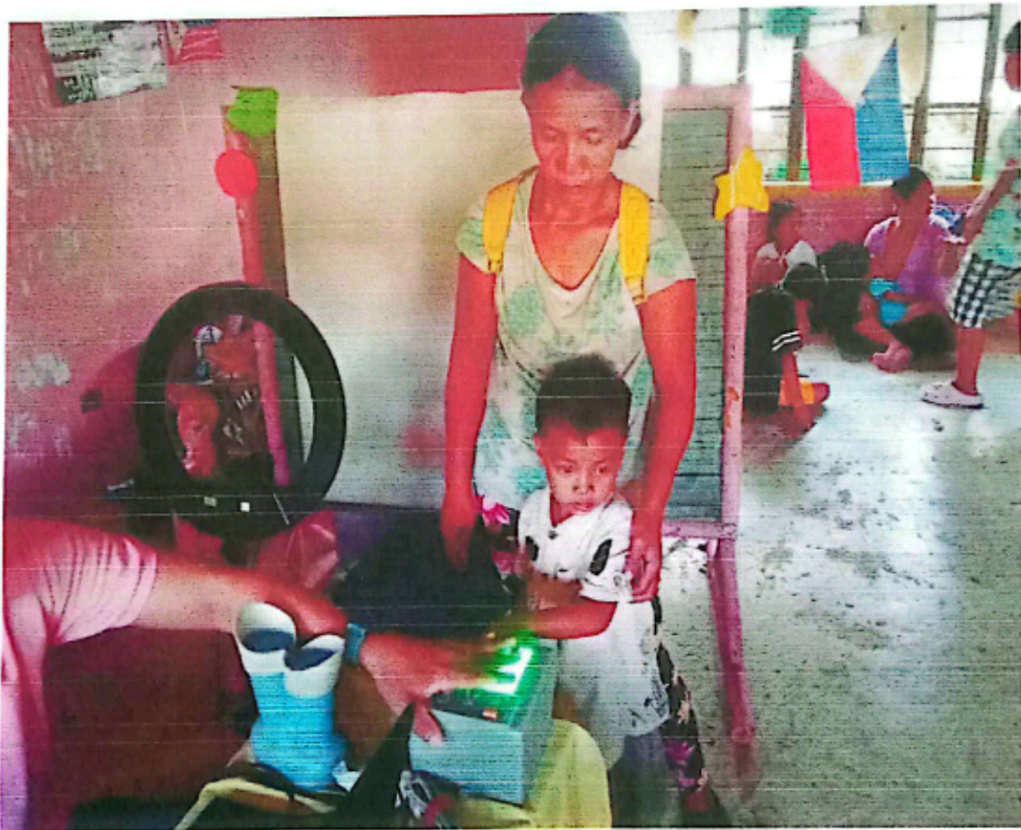
National ID Mobile Registration at Barangay Nicolas, Magsaysay, Occidental Mindoro

Date of release: January 25, 2025 Reference No. 2025PR-09