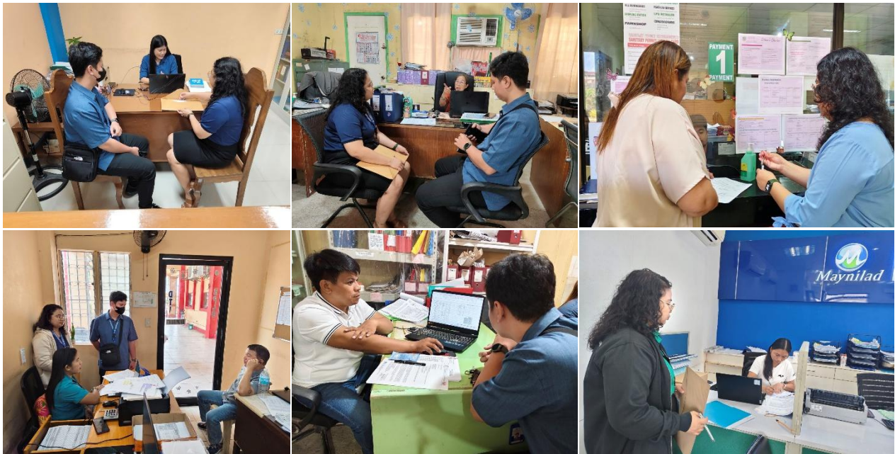
PSA PSO Marinduque's PPA personnels during their visits to LGUs and partner agencies for data collection.

Date of Release: 11 April 2025 Reference No. 2025PR-04-052