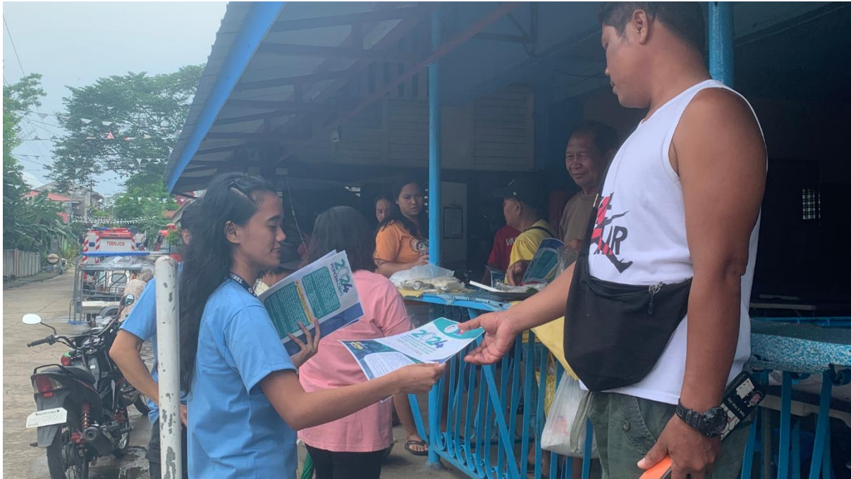
PSA-Marinduque PSO personnel distributing 2024 POPCEN-CBMS primers to the citizens of Torrijos, Marinduque

Starting from Brgy. Malibago to Brgy. Mabuhay, the bandilyo covered the entire boundary of Torrijos, Marinduque. Throughout the event, primers and brochures detailing the 2024 POPCEN-CBMS were distributed to residents along the route. Audio messages were also included, encouraging residents to actively participate in the census by providing accurate information to Enumerators (EN) who will visit every household and institutional living quarters in their assigned areas.