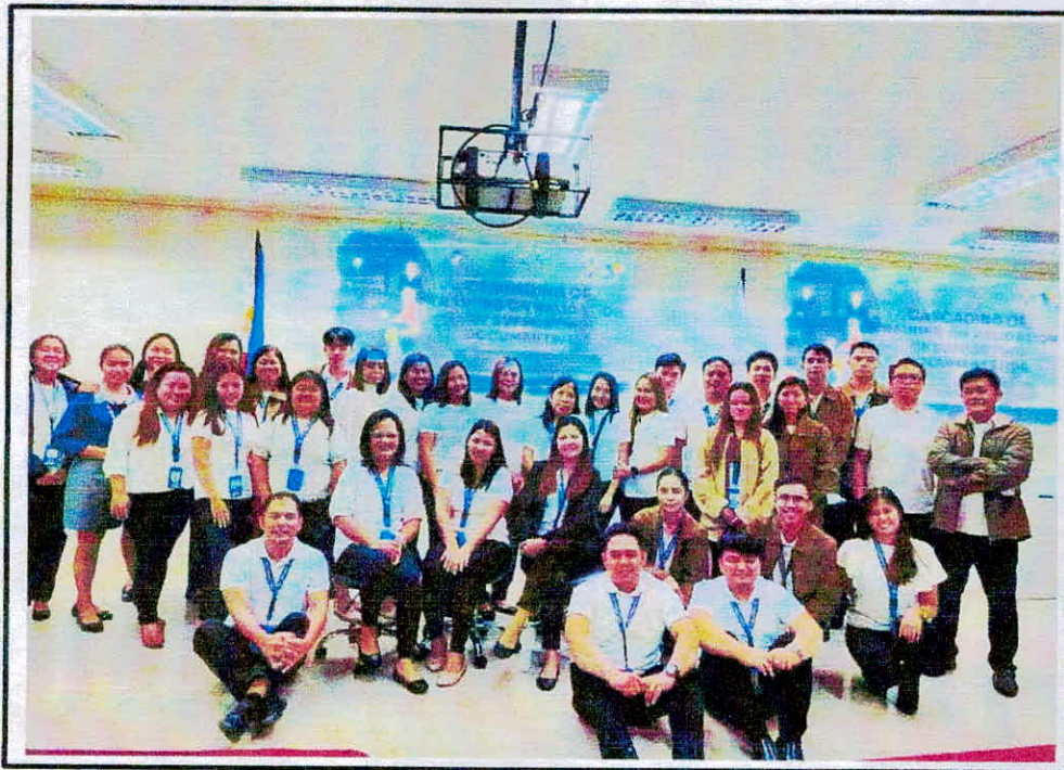
PSA RSSO staff photo opportunity after the discussion of Cascading of Training on Validation of supporting documents/IDs.

23 December 2024 – Philippine Statistics Authority Regional Statistical Services Office (PSA RSSO) MIMAROPA successfully conducted the Cascading of Training on Validation of Supporting Documents and IDs for its staff. This initiative aims to enhance the knowledge and skills of personnel in verifying the authenticity of documents and IDs, ensuring efficiency and accuracy in their validation processes.