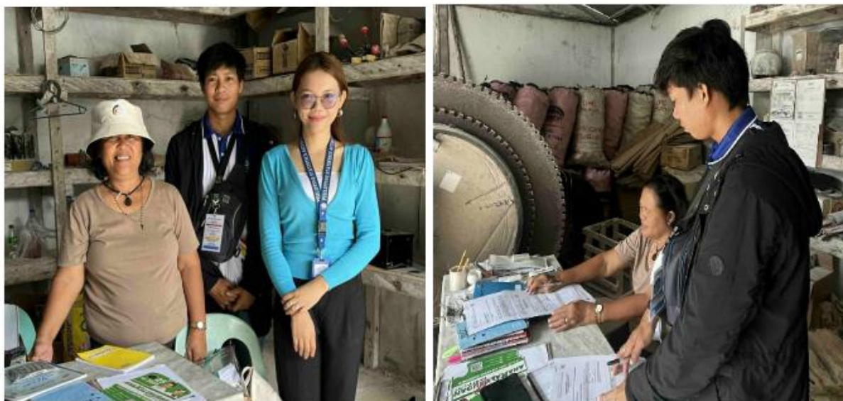
2025 CFS Data collection at 4J's Marble Shop & Supply at Cajimos, Romblon, Romblon.

2 JULY 2025 - ROMBLON, ROMBLON. The Philippine Statistics Authority (PSA) – Romblon Provincial Statistical Office is currently conducting the Second Quarter 2025 Commodity Flow Survey (CFS) among twelve (12) sample establishments located within the province. This initiative is part of the nationwide effort to collect timely and relevant data on the movement of commodities across provinces.