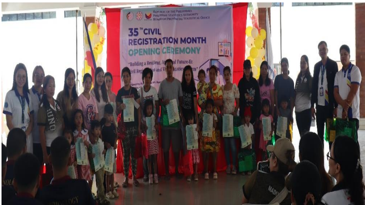
Day Care pupils, together with their parents, as they receive free Birth Certificates and school supplies from PSA Romblon as part of its Social Responsibility efforts.