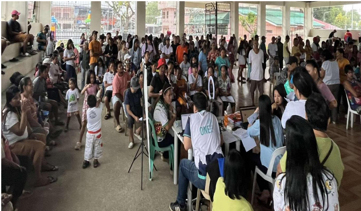
National ID Mobile Registration at Cajidiocan Covered Court, Brgy. Poblacion, Cajidiocan,

05-07 FEBRUARY 2025 – CAJIDIOCAN, ROMBLON. The Philippine Statistics Authority (PSA)-Romblon Provincial Statistical Office has intensified its conduct of National ID registration activities in far-flung communities, particularly in Geographically Isolated and Disadvantaged Areas and crossed seas to reach more Romblomanons.