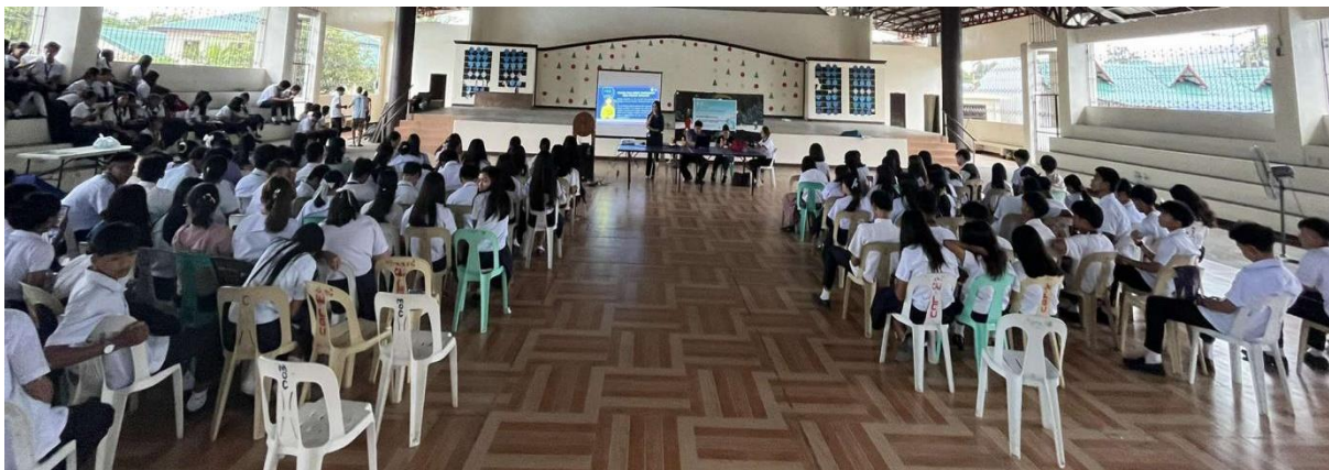
An information dissemination about National ID for students of Cajidiocan National High School.