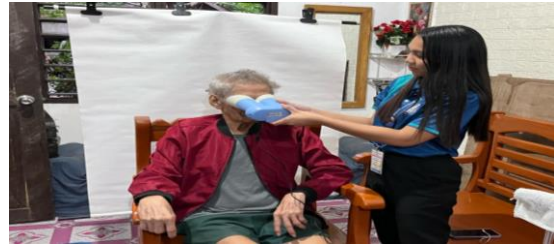
A special registration for an elderly person at Sitio Maligaya, Brgy. Cantagda, Cajidiocan, Romblon

Meanwhile, on February 07, 2025, a home service was conducted at Sitio Maligaya, Brgy. Cantagda, Cajidiocan, Romblon to register an elderly person who is unable to register on mobile registration sites. Challenges during the registration is undeniable but the desire to reach the most disadvantaged is one of the primary goals.