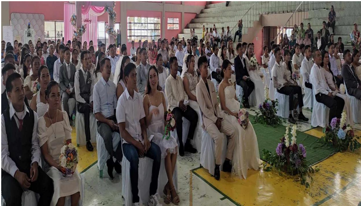
Thirty-two couples tied the knot in the Kalasang Bayan held in Odiongan, Romblon.